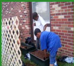
A youth is getting his hands dirty at the WRAMC vegetable garden.